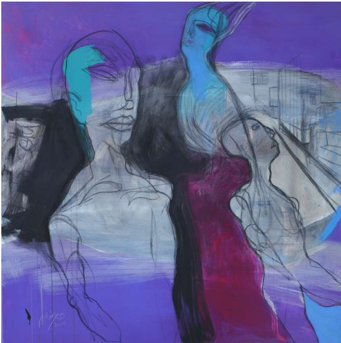
Observation, 2015 Charcoal and acrylic on canvas 120 x 120 cm