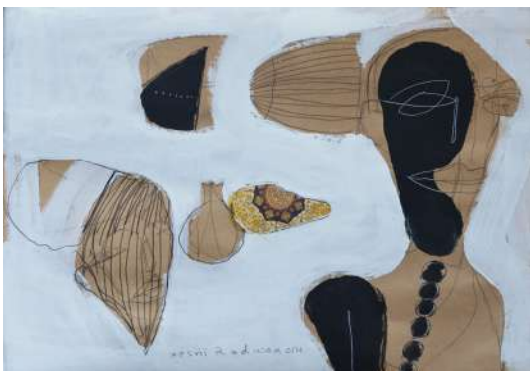
Chapter Ten, 2014 Mixed media on paper 35 x 50 cm