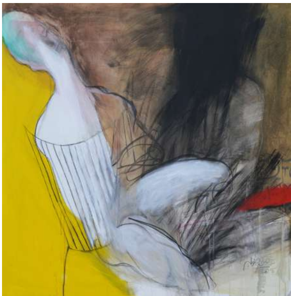
Releif, 2015 Mixed media on canvas 120 x 120 cm