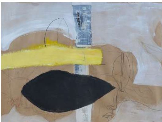
Attached, 2015 Mixed media on paper 50 x 66 cm