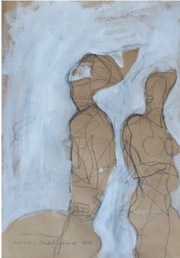
Discrete, 2014 Mixed media on paper 50 x 35 cm