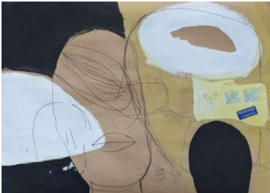
Breeze, 2014 Mixed media on paper 35 x 50 cm