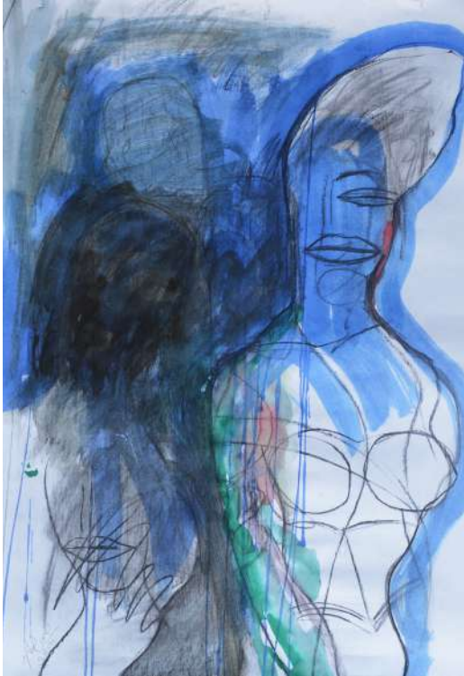
Changeful I Mixed media on paper 90 x 65 cm