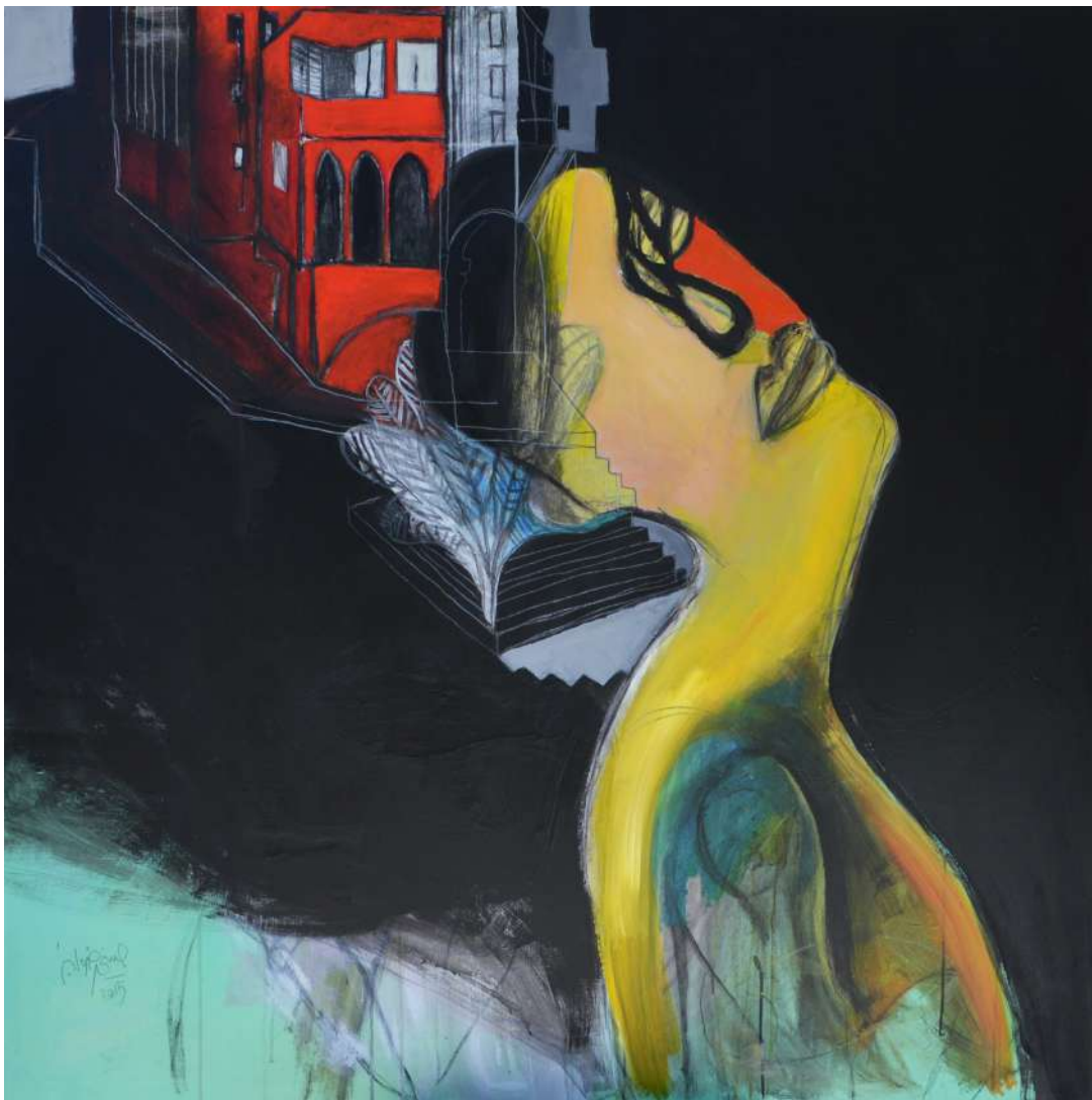
Ain-Elmriase, 2015 Mixed media on canvas 150 x 150 cm