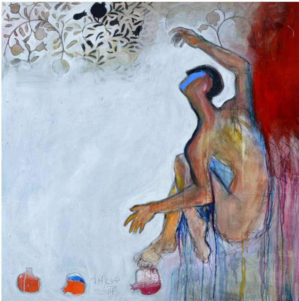
Pomegranate Dreams, 2014 Acrylic on canvas 150 x 150 cm