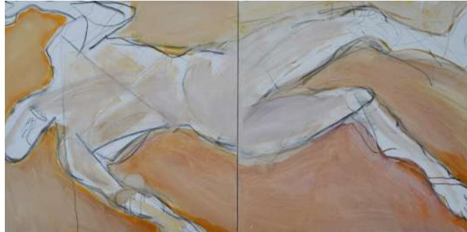
Untitled, 2015 Mixed media on canvas (set of two) 70 x 70 cm each