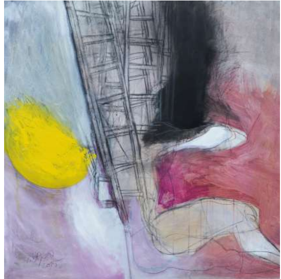
Ladders, 2015 Charcoal and acrylic on canvas 120 x 120 cm