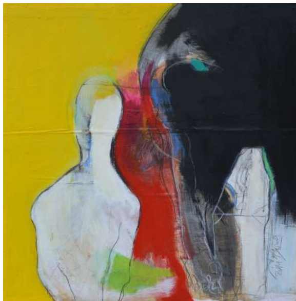
Traveler, 2014 Mixed media on wood 109 x 109 cm