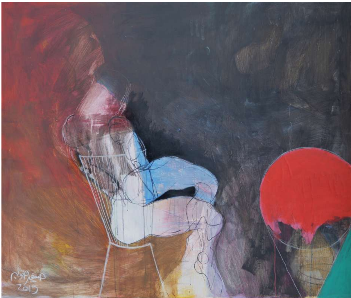
Fragments, 2015 Mixed media on canvas 150 x 180 cm