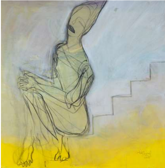
Patiently Waiting, 2015 Charcoal and acrylic on canvas 120 x 120 cm