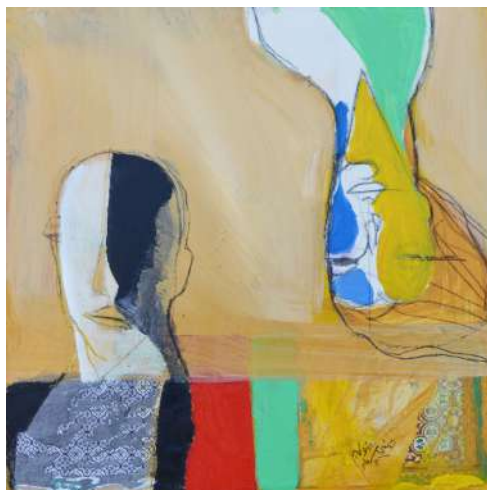
Obverse, 2015 Mixed media on canvas 50 x 50 cm