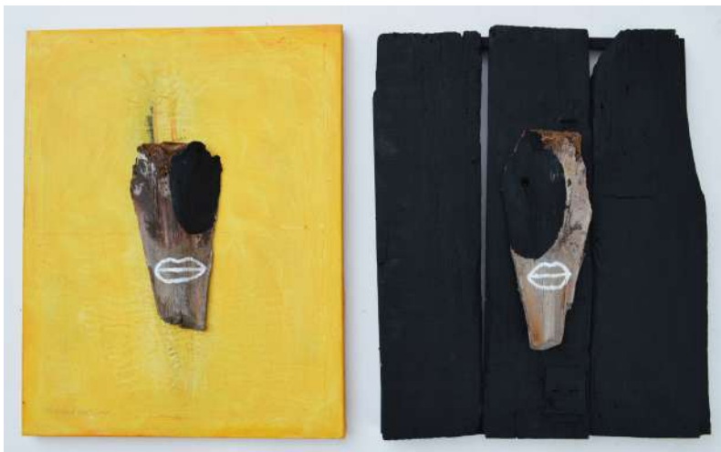
Mask, 2014 Mixed media (set of two) 70 x 55 cm each