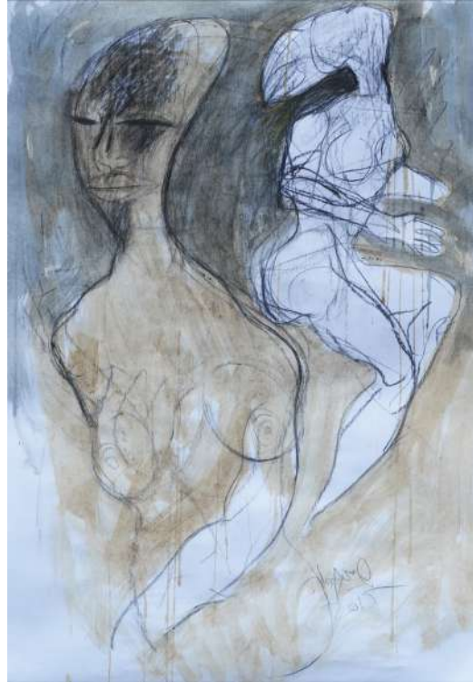
Changeful II Mixed media on paper 90 x 65 cm