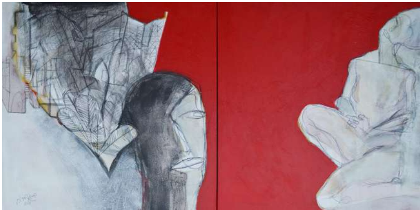
Untitled, 2015 Mixed media on canvas (set of two) 70 x 70 cm each