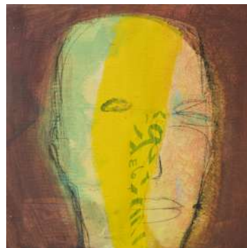
Faces (1-8) 2015 Mixed media on canvas 50 x 50 cm (each)