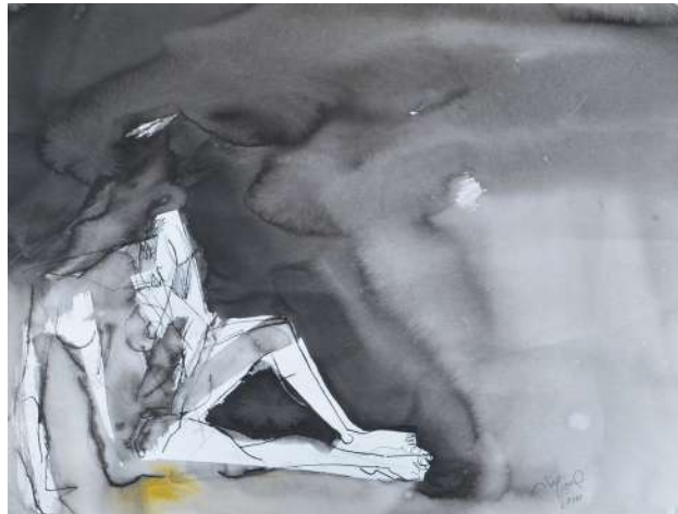
Nude, 2014 Ink on paper 50 x 65 cm