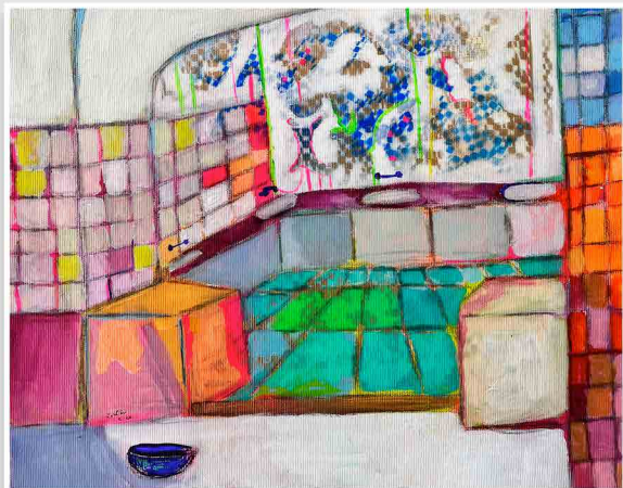
Rana Samara Untitled (14) , 2022 Acrylic and spray paint on canvas 30 x 40 cm | 12.8" x 15.7"