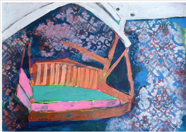
Rana Samara Untitled (16) , 2022 Acrylic and spray paint on canvas 30 x 40 cm | 12.8" x 15.7"