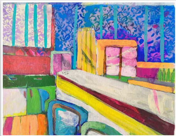
Rana Samara Untitled (11) , 2022 Acrylic and spray paint on canvas 30 x 40 cm | 12.8" x 15.7"