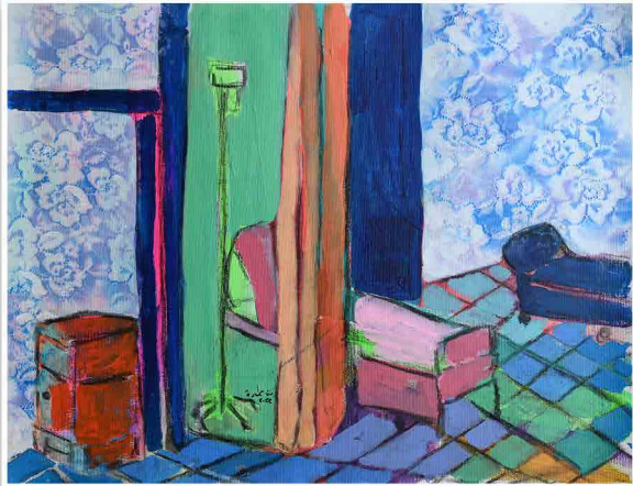
Rana Samara Untitled (26) , 2022 Acrylic and spray paint on canvas 30 x 40 cm | 12.8" x 15.7"