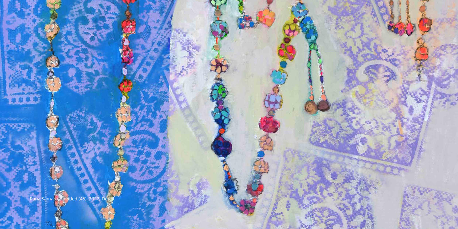
Rana Samara, Untitled (45), 2022, Detail