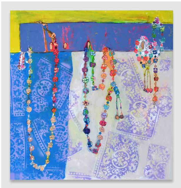
Rana Samara Untitled (45) , 2022 Acrylic and spray paint on canvas 101 x 97 cm | 40" x 38"