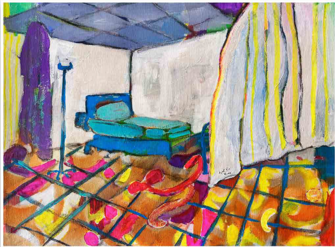
Rana Samara Untitled (2) , 2022 Acrylic and spray paint on canvas 30 x 40 cm | 12.8" x 15.7"