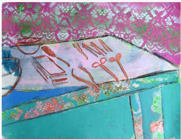
Rana Samara Untitled (21) , 2022 Acrylic and spray paint on canvas 30 x 40 cm | 12.8" x 15.7"