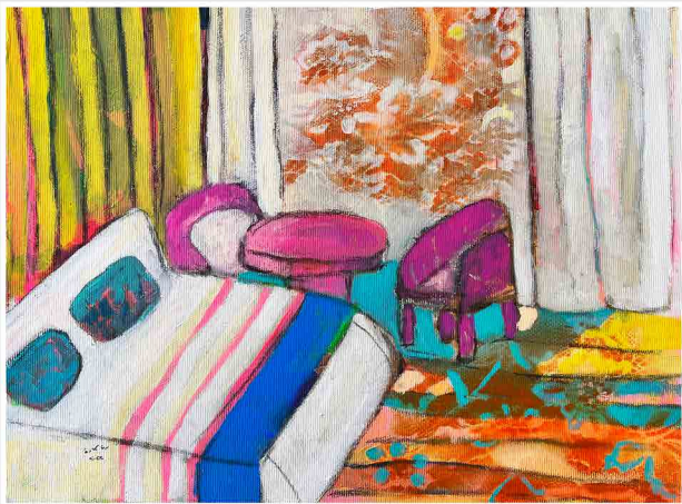
Rana Samara Untitled (10) , 2022 Acrylic and spray paint on canvas 30 x 40 cm | 12.8" x 15.7"