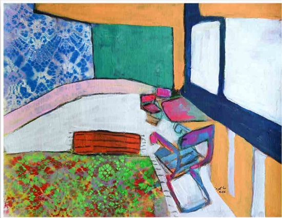
Rana Samara Untitled (30) , 2022 Acrylic and spray paint on canvas 30 x 40 cm | 12.8" x 15.7"