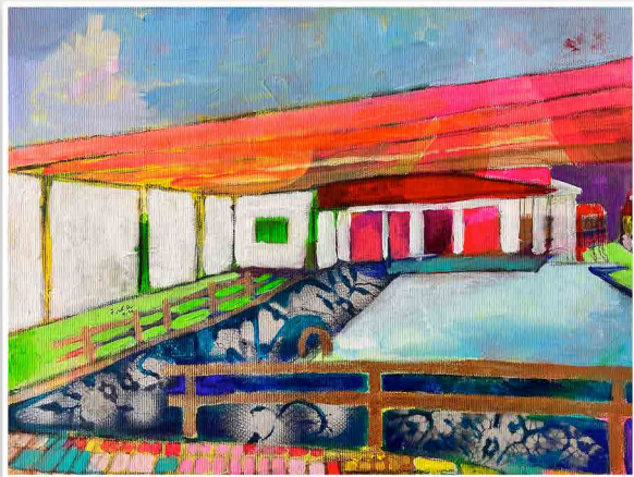
Rana Samara Untitled (12) , 2022 Acrylic and spray paint on canvas 30 x 40 cm | 12.8" x 15.7"