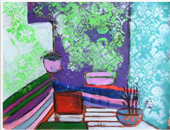
Rana Samara Untitled (27) , 2022 Acrylic and spray paint on canvas 30 x 40 cm | 12.8" x 15.7"