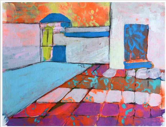
Rana Samara Untitled (32) , 2022 Acrylic and spray paint on canvas 30 x 40 cm | 12.8" x 15.7"