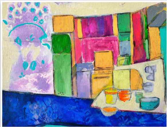
Rana Samara Untitled (13) , 2022 Acrylic and spray paint on canvas 30 x 40 cm | 12.8" x 15.7"