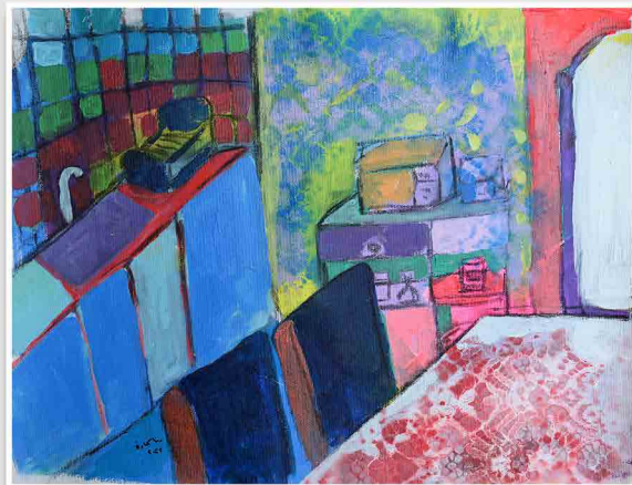
Rana Samara Untitled (20) , 2022 Acrylic and spray paint on canvas 30 x 40 cm | 12.8" x 15.7"