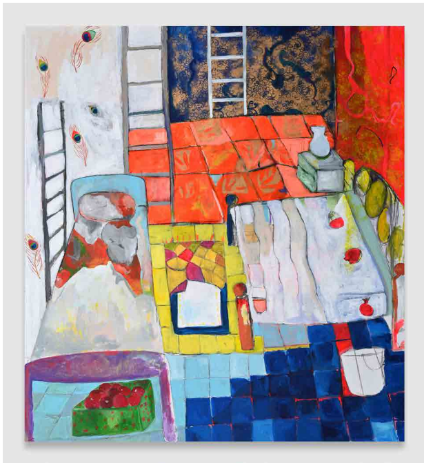
Rana Samara Untitled (44) , 2022 Acrylic and spray paint on canvas 203 x 187 cm | 80" x 74"