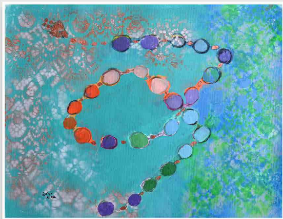
Rana Samara Untitled (33) , 2022 Acrylic and spray paint on canvas 30 x 40 cm | 12.8" x 15.7"