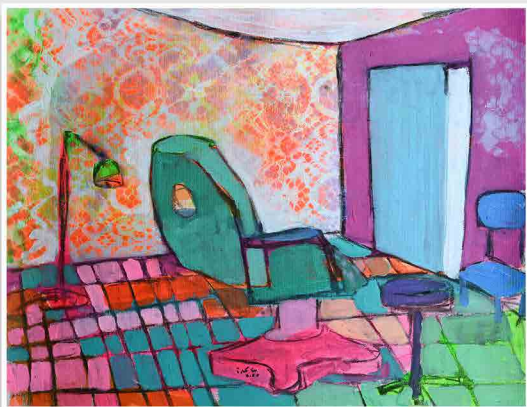
Rana Samara Untitled (37) , 2022 Acrylic and spray paint on canvas 30 x 40 cm | 12.8" x 15.7"