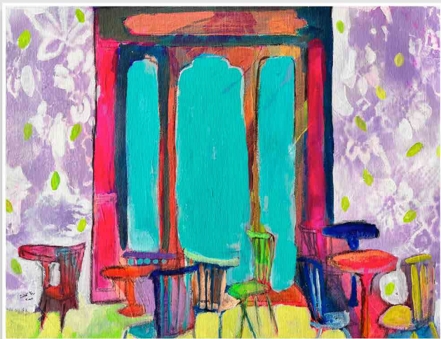
Rana Samara Untitled (4) , 2022 Acrylic and spray paint on canvas 30 x 40 cm | 12.8" x 15.7"