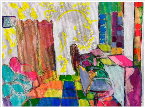
Rana Samara Untitled (15) , 2022 Acrylic and spray paint on canvas 30 x 40 cm | 12.8" x 15.7"