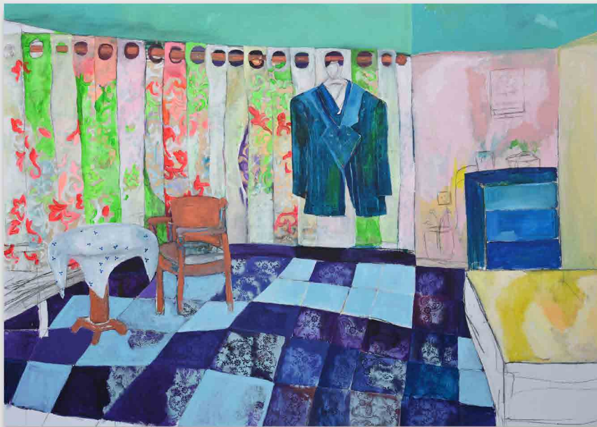
Rana Samara Untitled (42) , 2021 Acrylic and spray paint on canvas 203 x 290 cm | 80" x 114"