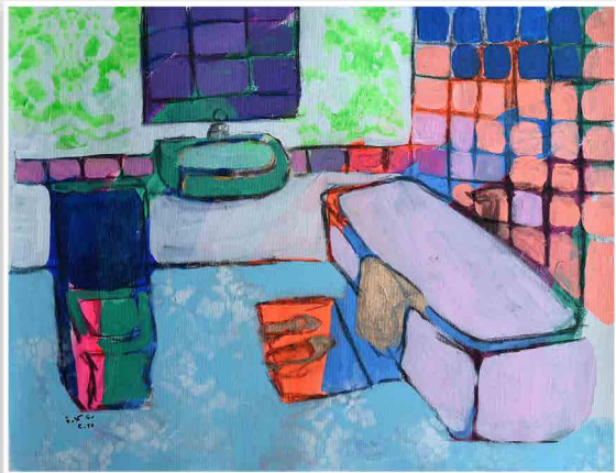
Rana Samara Untitled (29) , 2022 Acrylic and spray paint on canvas 30 x 40 cm | 12.8" x 15.7"