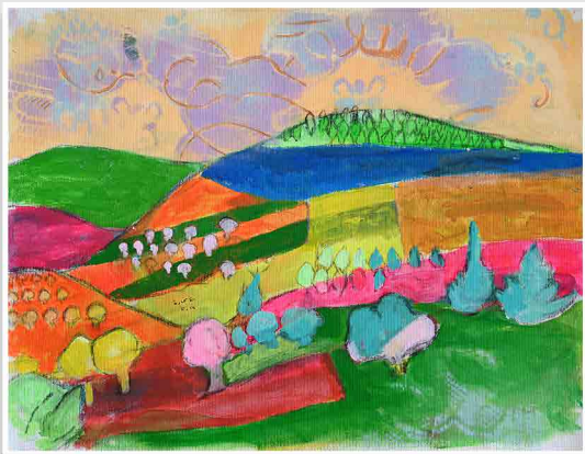
Rana Samara Untitled (40) , 2022 Acrylic and spray paint on canvas 30 x 40 cm | 12.8" x 15.7"