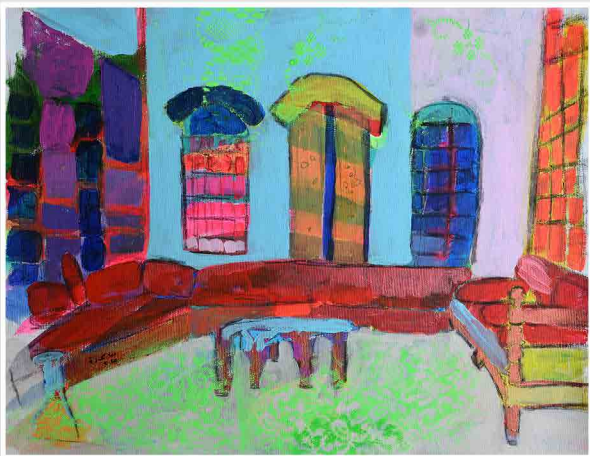
Rana Samara Untitled (23) , 2022 Acrylic and spray paint on canvas 30 x 40 cm | 12.8" x 15.7"