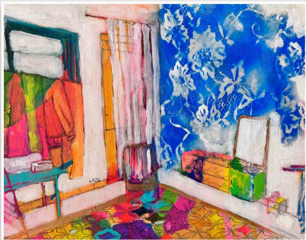
Rana Samara Untitled (3) , 2022 Acrylic and spray paint on canvas 30 x 40 cm | 12.8" x 15.7"