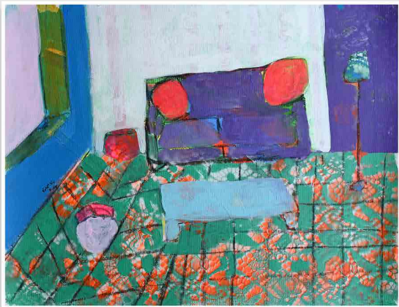
Rana Samara Untitled (17) , 2022 Acrylic and spray paint on canvas 30 x 40 cm | 12.8" x 15.7"