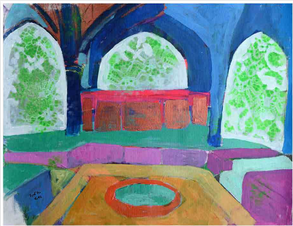
Rana Samara Untitled (24) , 2022 Acrylic and spray paint on canvas 30 x 40 cm | 12.8" x 15.7"