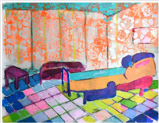
Rana Samara Untitled (36) , 2022 Acrylic and spray paint on canvas 30 x 40 cm | 12.8" x 15.7"