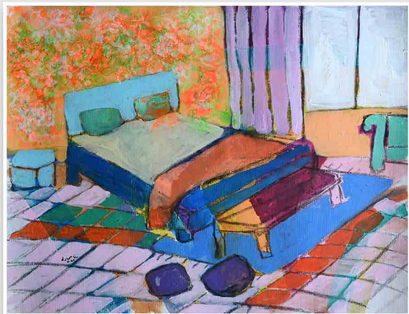
Rana Samara Untitled (18) , 2022 Acrylic and spray paint on canvas 30 x 40 cm | 12.8" x 15.7"