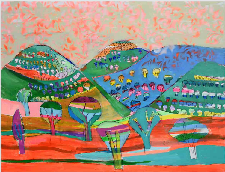
Rana Samara Untitled (47) , 2022 Acrylic and spray paint on canvas 105 x 139 cm | 41" x 54.7"