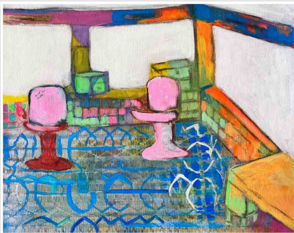
Rana Samara Untitled (8) , 2022 Acrylic and spray paint on canvas 30 x 40 cm | 12.8" x 15.7"