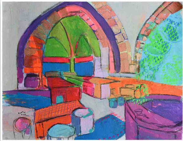
Rana Samara Untitled (22) , 2022 Acrylic and spray paint on canvas 30 x 40 cm | 12.8" x 15.7"