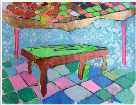
Rana Samara Untitled (35) , 2022 Acrylic and spray paint on canvas 30 x 40 cm | 12.8" x 15.7"