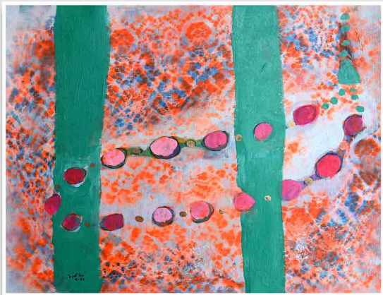
Rana Samara Untitled (34) , 2022 Acrylic and spray paint on canvas 30 x 40 cm | 12.8" x 15.7"