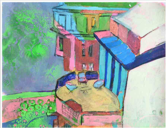
Rana Samara Untitled (19) , 2022 Acrylic and spray paint on canvas 30 x 40 cm | 12.8" x 15.7"