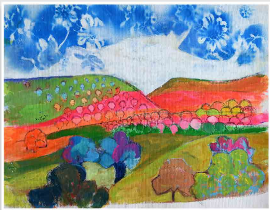
Rana Samara Untitled (39) , 2022 Acrylic and spray paint on canvas 30 x 40 cm | 12.8" x 15.7"