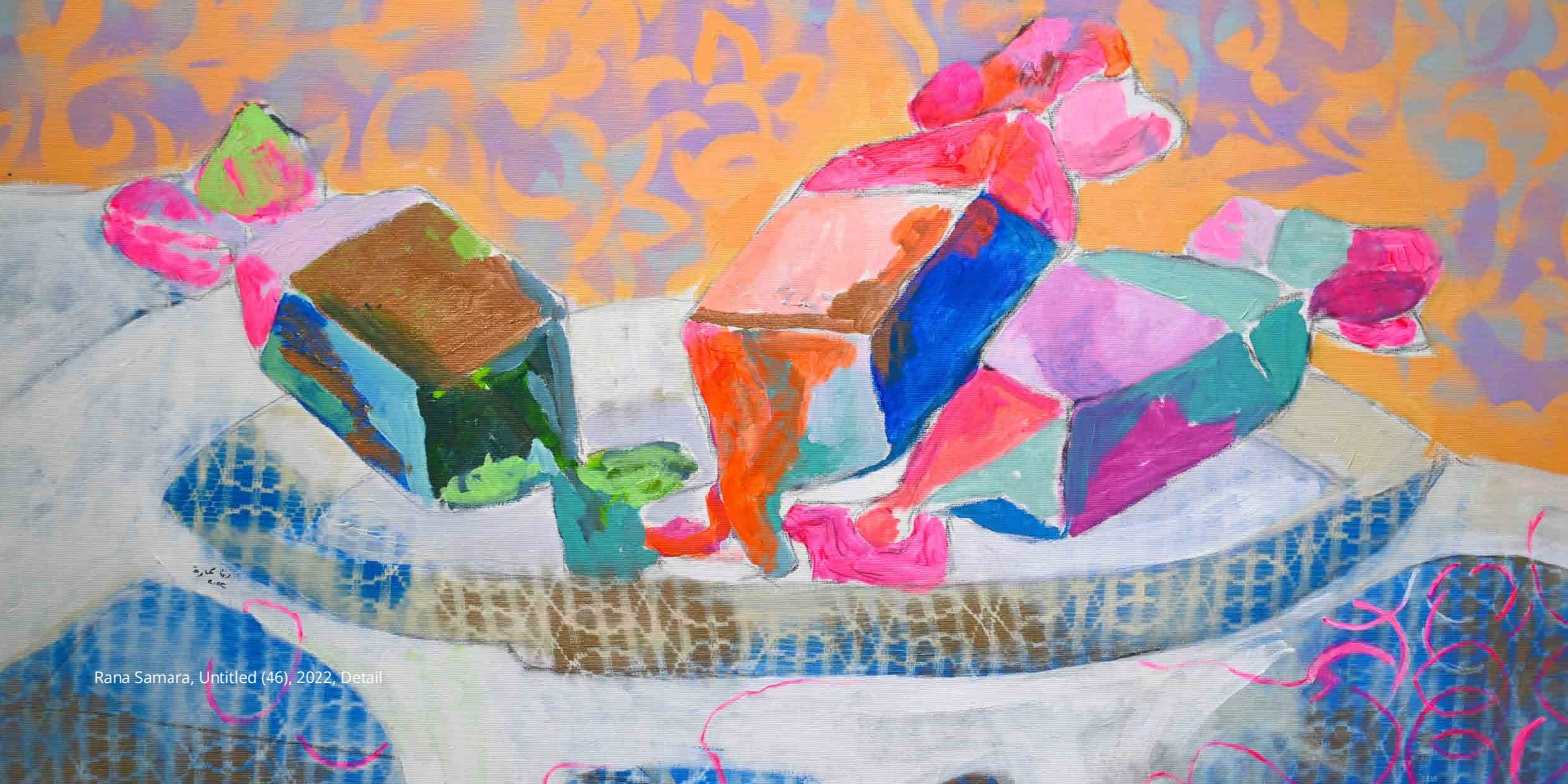
Rana Samara, Untitled (46), 2022, Detail