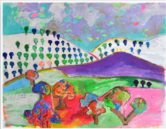
Rana Samara Untitled (38) , 2022 Acrylic and spray paint on canvas 30 x 40 cm | 12.8" x 15.7"