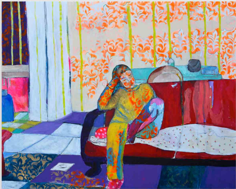
Rana Samara Untitled (43) , 2021 Acrylic and spray paint on canvas 161 x 201 cm | 63" x 79"