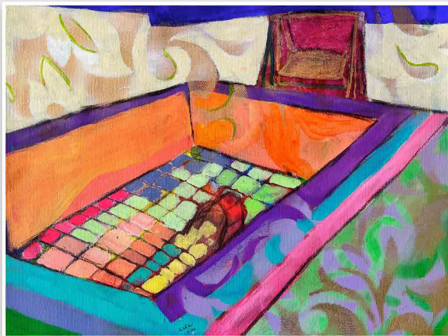
Rana Samara Untitled (1) , 2022 Acrylic and spray paint on canvas 30 x 40 cm | 12.8" x 15.7"