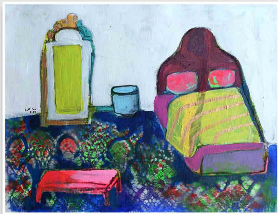
Rana Samara Untitled (31) , 2022 Acrylic and spray paint on canvas 30 x 40 cm | 12.8" x 15.7"