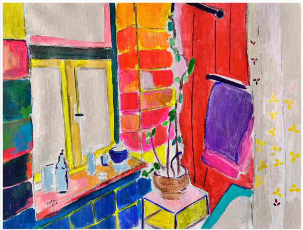
Rana Samara Untitled (9) , 2022 Acrylic and spray paint on canvas 30 x 40 cm | 12.8" x 15.7"