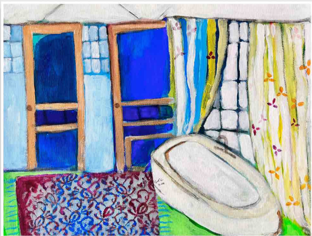
Rana Samara Untitled (5) , 2022 Acrylic and spray paint on canvas 30 x 40 cm | 12.8" x 15.7"