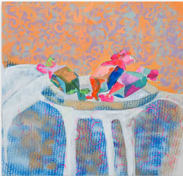
Rana Samara Untitled (46) , 2022 Acrylic and spray paint on canvas 101 x 105 cm | 40" x 41"