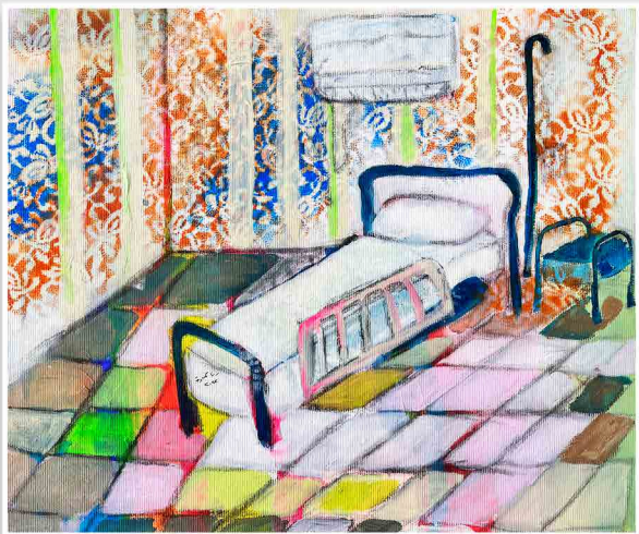
Rana Samara Untitled (6) , 2022 Acrylic and spray paint on canvas 30 x 40 cm | 12.8" x 15.7"