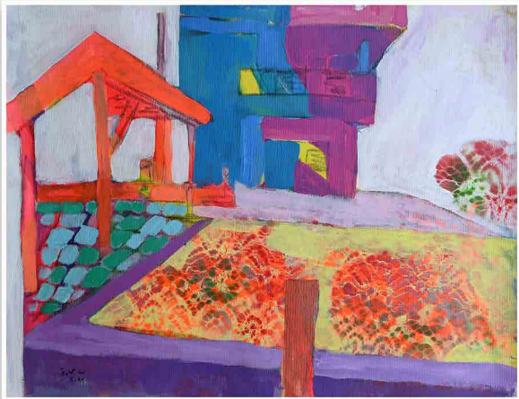
Rana Samara Untitled (25) , 2022 Acrylic and spray paint on canvas 30 x 40 cm | 12.8" x 15.7"