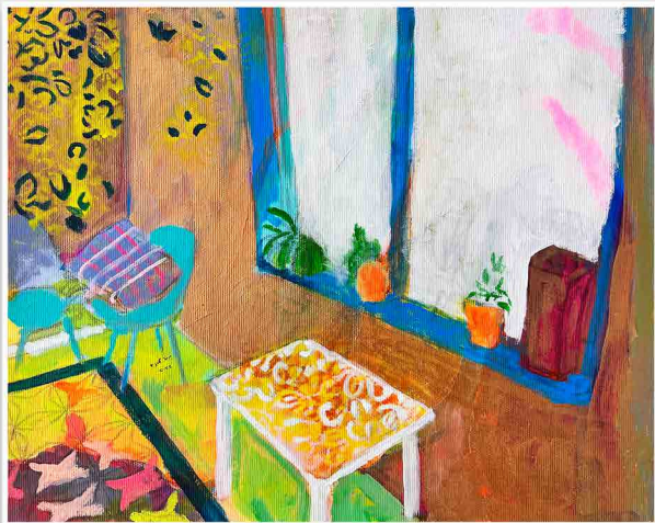
Rana Samara Untitled (7) , 2022 Acrylic and spray paint on canvas 30 x 40 cm | 12.8" x 15.7"